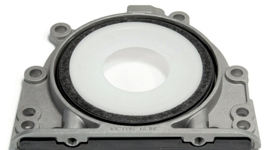
Figure 2_Underside of the integrated rotary shaft seal

Victor Reinz® – the best way to get a good gasket.